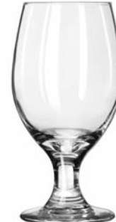
Banquet Goblet No. 3010 ■ 14 oz./41.4 cl./414 ml. H6½ T2¾ B3 D3¾ 2 doz./17# = 1.33 cu.ft. SCC 055118 TRAEX TR-6BBB □