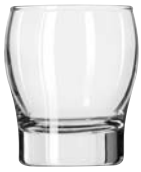
Rocks No. 2391 ● 7 oz./20.7 cl./207 ml. H3¾ T2¾ B2¾ D3 2 doz./13# • .57 cu.ft. SCC 059017 TRAEX TR-7C □