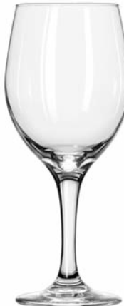
Tall Wine No. 3060 ■ 20 oz./59.2 cl./592 ml. H8½ T3½ B3¼ D3¾ 1 doz./10# = 1.10 cu.ft. SCC 077561 TRAEX TR-11GGGG □