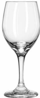
Tall Goblet No. 3011 ■ 14 oz./41.4 cl./414 ml. H8¼ T2¾ B3 D3¾ 2 doz./18# = 1.63 cu.ft. SCC 027924 TRAEX TR-6BBBB □