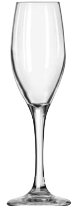
Flute No. 3096 ■ 5¾ oz./17.0 cl./170 ml. H8½ T1½ B2¾ D2¾ 1 doz./6# = .57 cu.ft. SCC 252340 TRAEX TR-7CCC □